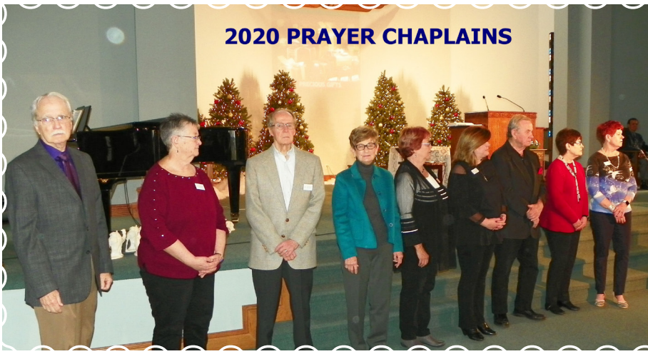
2020 PRAYER CHAPLAINS