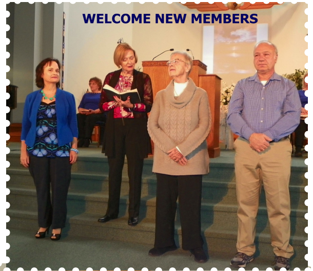
WELCOME NEW MEMBERS