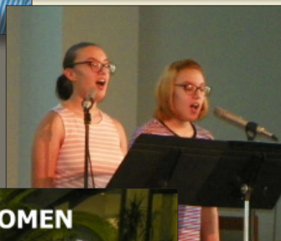
FIRST UNITY'S 3 WISE WOMEN